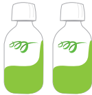
Two bottles of CLENPIQ (5.4 oz each)